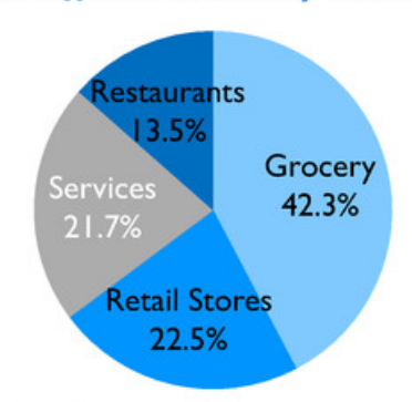
Top 5 Grocers by Annualized Effective Rent